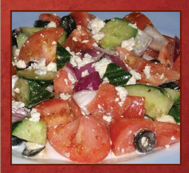
Ask about our dressing choice. Sundried Tomato Pesto, Peppercorn Ranch, Thousand Island, Balsamic, Ranch, French, Italian & Raspberry. (Selection may vary by location)