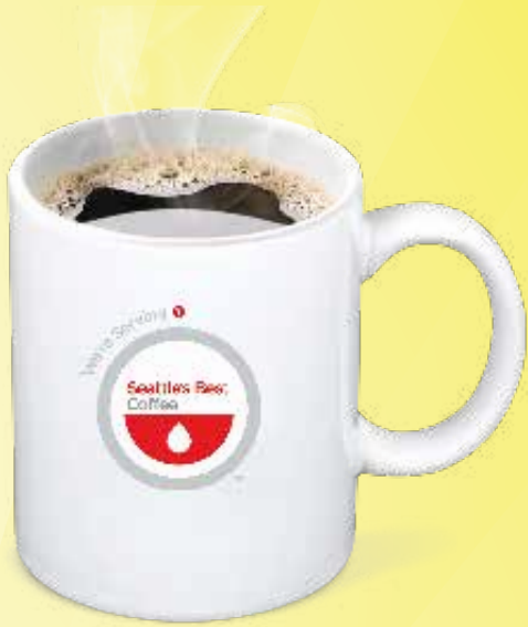
Seattle's Best Coffee and the Seattle's Best Coffee logo are registered trademarks of Seattle's Best Coffee, LLC. Approval code: SBUXC-00071.

EXTRA LARGE size. Free refill with meal.